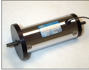
Moving Magnet (NCM)