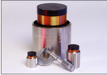
Moving Coil (NCC)